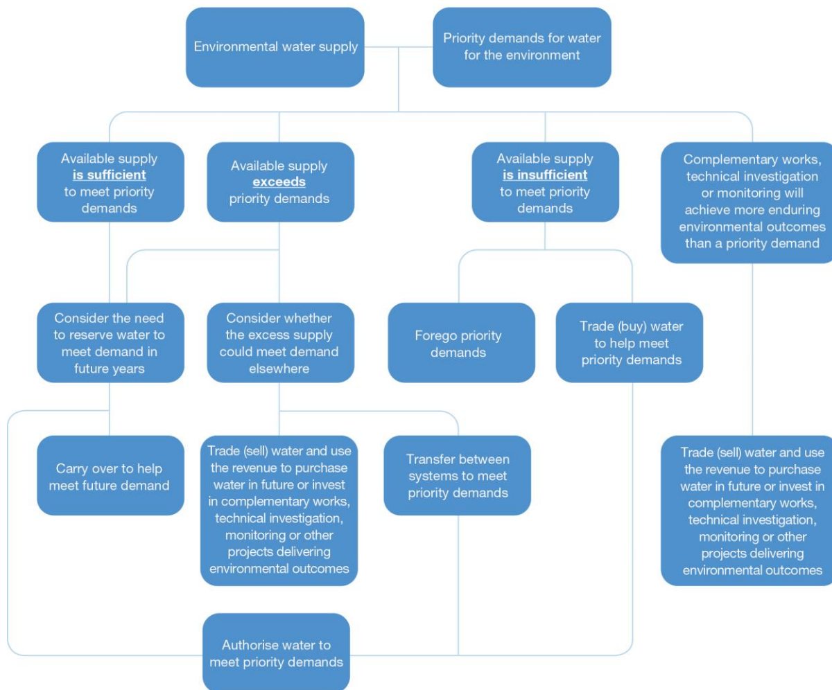
Figure 1 - Considerations guiding use, carryover and trade decisions

The following sections detail trade actions that the VEWH may take based on current water availability assessments and seasonal forecasts. Decisions to undertake the actions identified in this strategy will depend on unfolding seasonal conditions and environmental water demands in 2021-22 and into 2022-23.