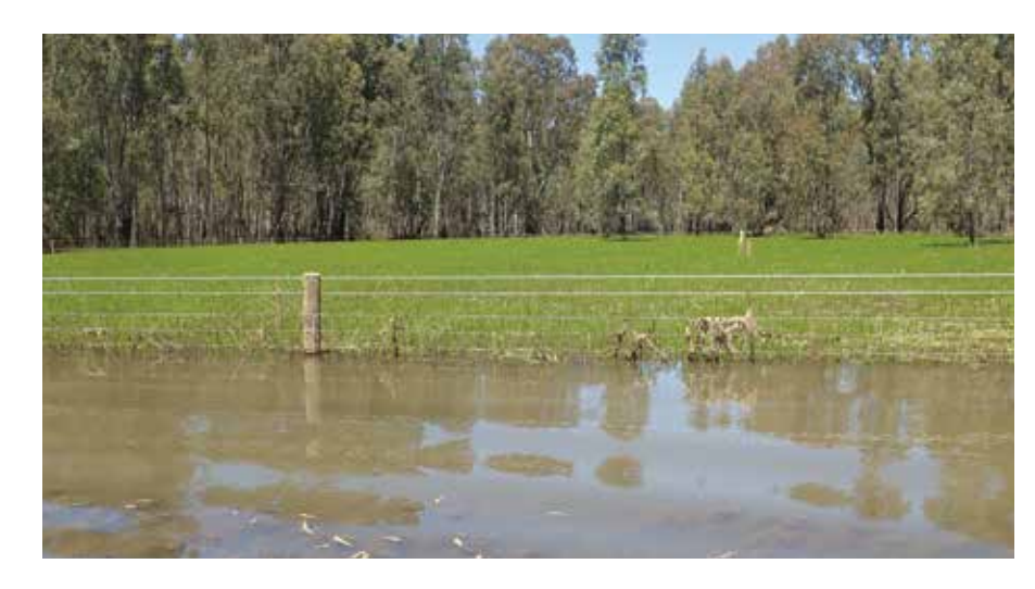
Above: Top Lake Exclusion Fence in Barmah-Millewa Forest showing extensive Moira grass coverage where grazing animals have been excluded

The winter-spring 2021 delivery of environmental flows was the fifth time the water had been managed to replicate natural flows onto the floodplain through winter and spring, by opening water regulator structures regardless of river levels. This method of delivery has allowed the floodplain water to connect with the river more gradually and monitoring has