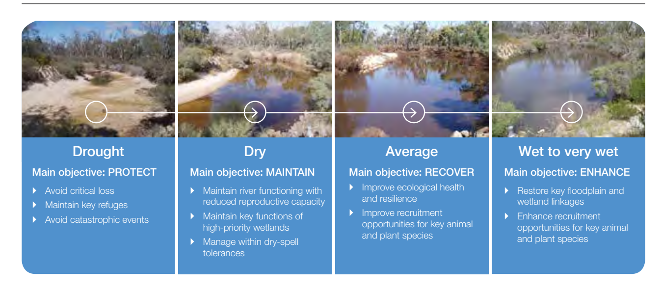
Figure 1.2.1 Examples of environmental watering objectives under different planning scenarios

Each year, waterway managers scope the potential environmental watering actions for their regions for the coming year in seasonal watering proposals. The proposals draw on environmental flow studies and on longer-term plans (such as environmental water management plans and regional waterway strategies). The proposals incorporate information and advice from local communities.